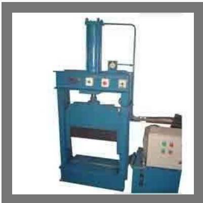
Pneumatic Toggle Press