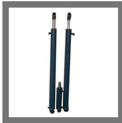
Industrial Hydraulic Cylinders