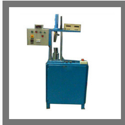
Bond Strength Testing Machine