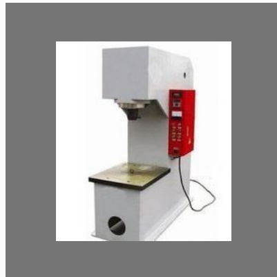
C Frame Hydraulic Press