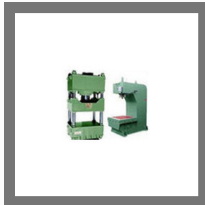
Hydraulic Compression Molding Machine