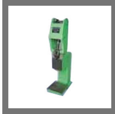
Pneumatic Toggle Press