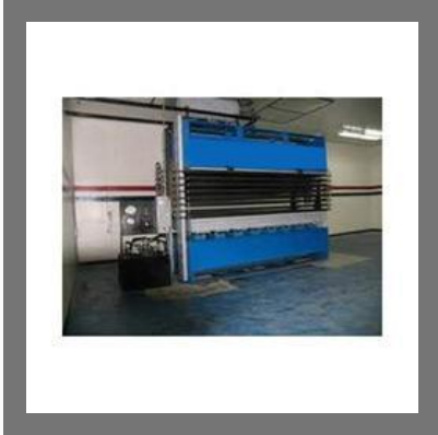
Hydraulic Large Platen Press