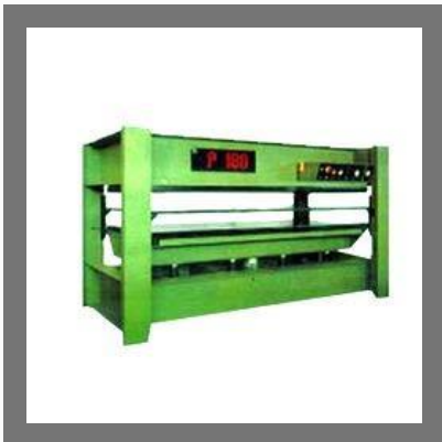
Hydraulic Downstroke Press