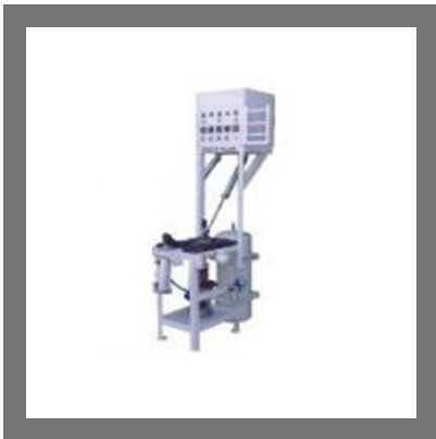
Pneumatic Transfer Molding Machine