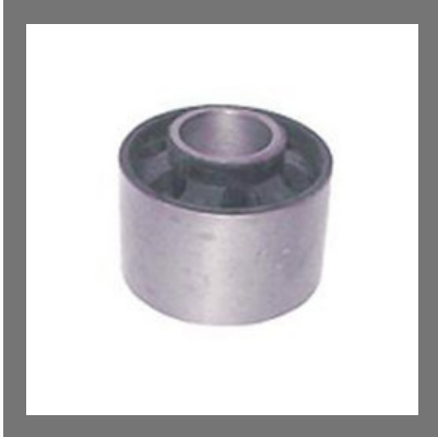
Silent Block Bush