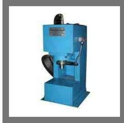
Compact Table Type Mounting Special Purpose Machine