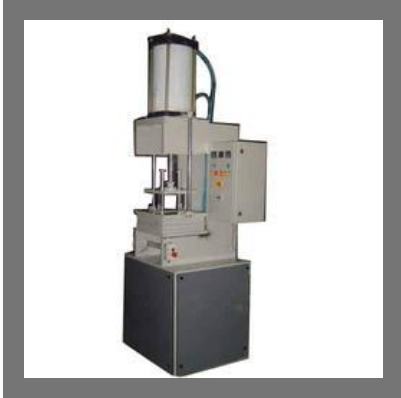
Transfer Over Molding Machine