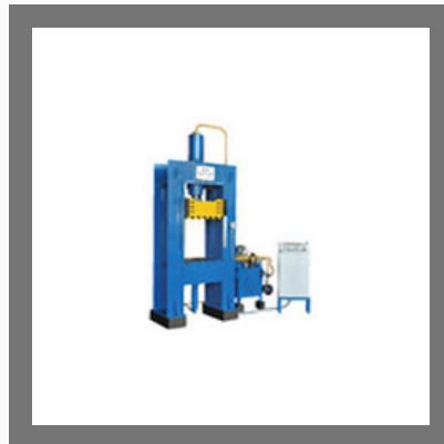
Hydraulic H Frame Press