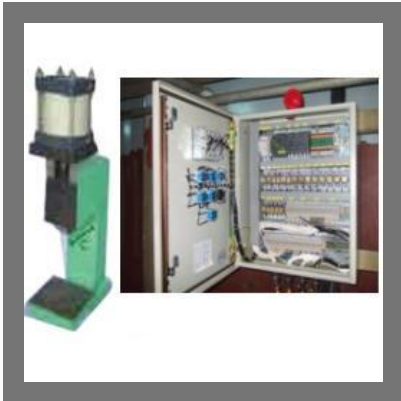
Industrial Automation Pneumatic Press