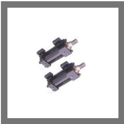
Lug Mounted Hydraulic Cylinders