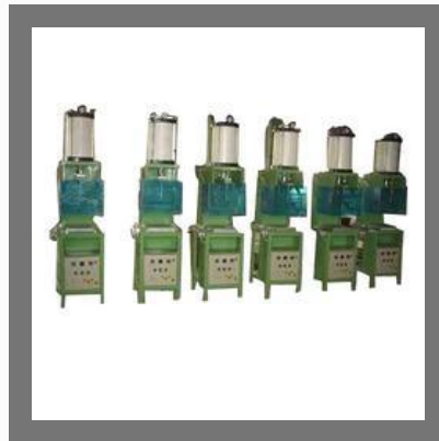
Pneumatic Single Action Transfer Molding Machine