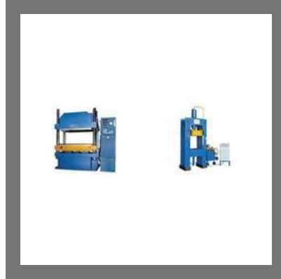
Industrial Automation Hydraulic Press