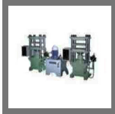
Industrial Molding Machine