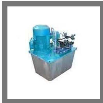
Heavy Duty Power Pack