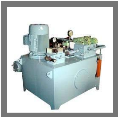
Industrial Hydraulic Power Pack