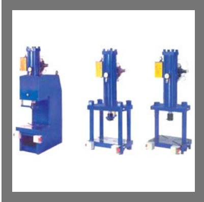
Hydro Pneumatic Presses