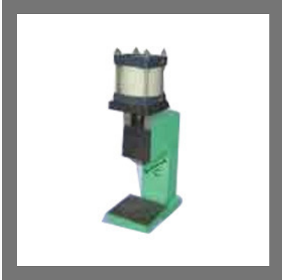
Pneumatic Direct Acting Press