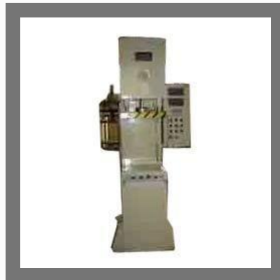
Hydraulic Linker Type Press