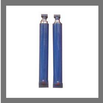
Telescopic Hydraulic Cylinder