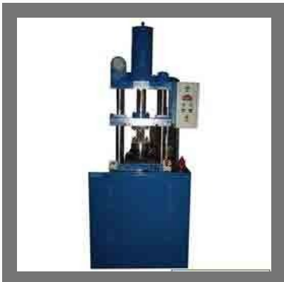
Hydraulic Testing Machine