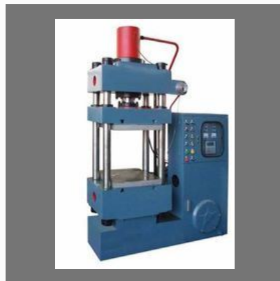
Pillar Type Hydraulic Press