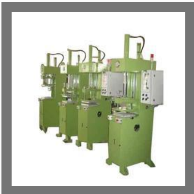
PLC Controlled Molding Machine