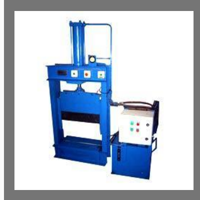
Pneumatic Direct Acting Press