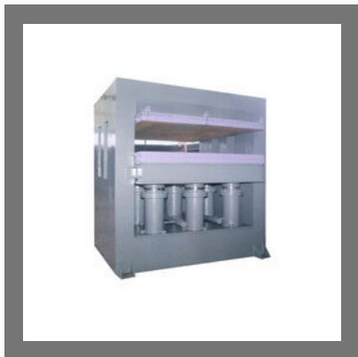
Rubber Molding Machine