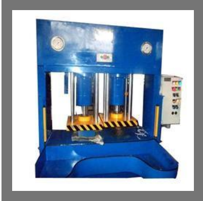
Hydraulic Press Machines