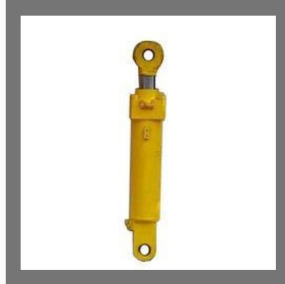
Tipping Hydraulic Cylinders