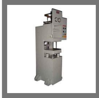
Heavy Transfer Molding Machine