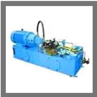
Oil Hydraulic Power Pack