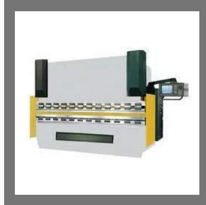
Down Electro Hydraulic Press