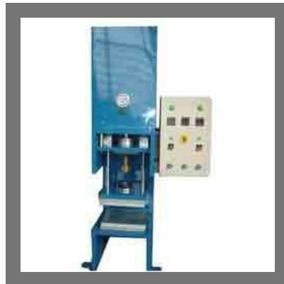
Down Clamp Transfer Molding Machine