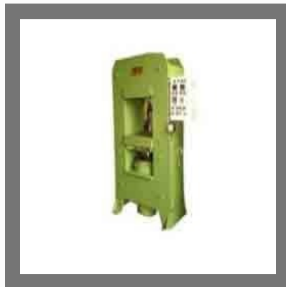
Industrial Rubber Molding Machine