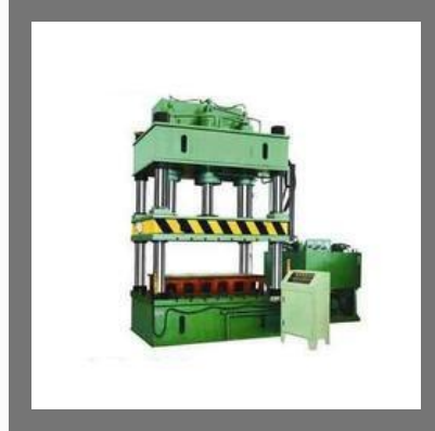
Large Platen Down Stroke Press