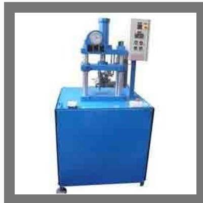
Hydraulic Testing Machine