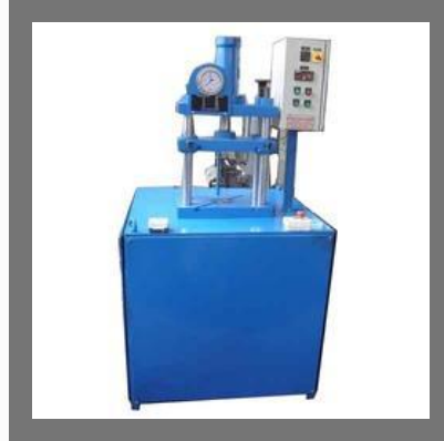
Down Stroke Hydraulic Press