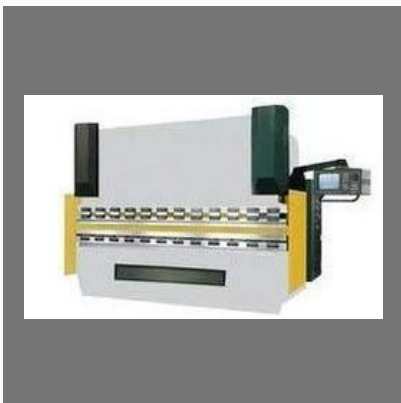
Guided Pattern Hydraulic Press