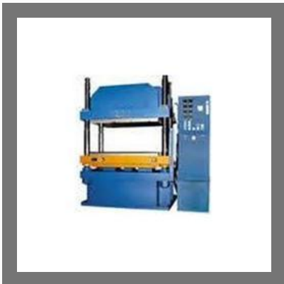
Large Platen Press