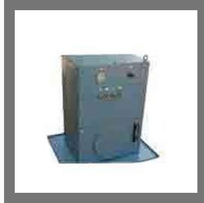
Hydraulic Power Packs