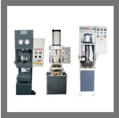
Hydraulic Transfer Molding Machine