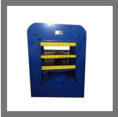
Hydraulic Compression Machine