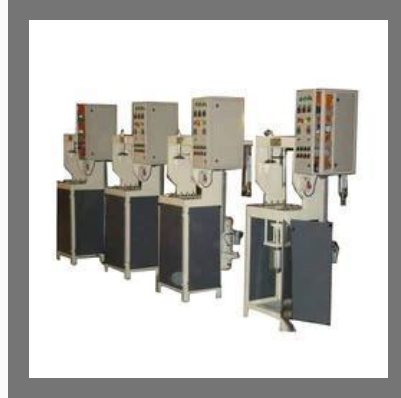
Transfer Molding Machine