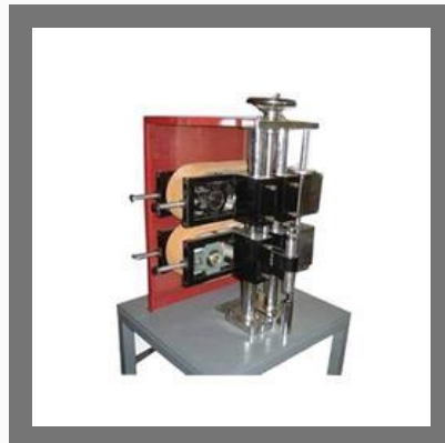
Haul Off Machine