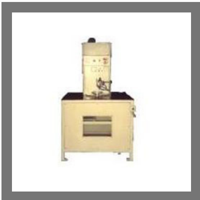
Special Purpose Machine