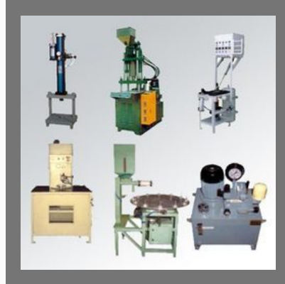
Industrial Special Purpose Machine