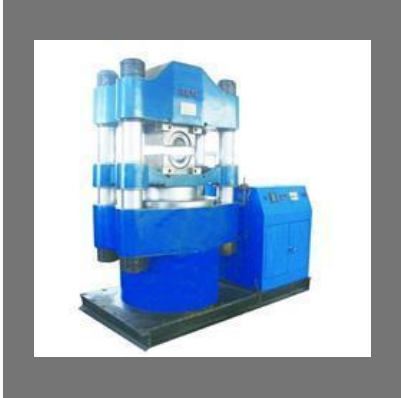
Hydraulic Swaging Machine