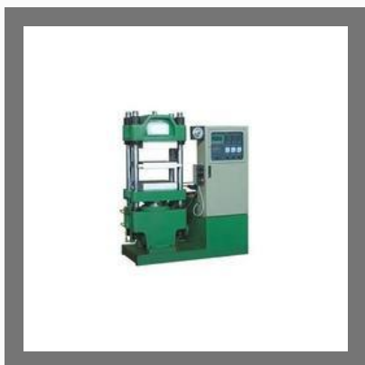
Hydraulic Rubber Molding Machine