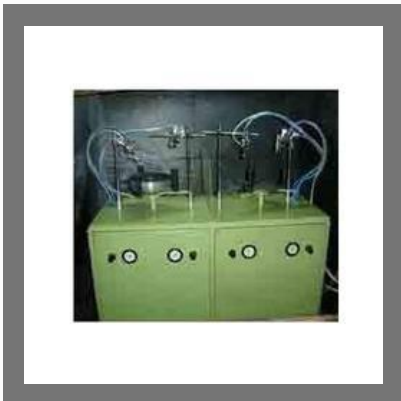
Teflon Coating Machine