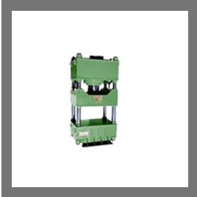
Hydraulic H Frame Press